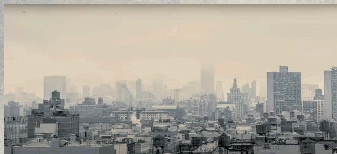
Michael Monroe: Ballad of the Lower East Side